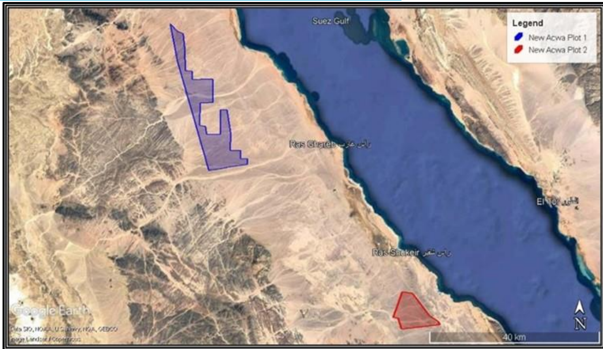
Figure 1: Project Site (Plot 2 in red)